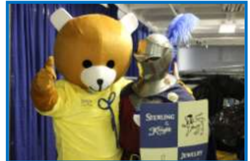
Parker makes an appearance at Mascot Madness at the Odeum with the Knight from Sterling & Knight Jewelry & Pawn

Parker is the official mascot of the VP 100 th Anniversary Celebration. He's known to pop up all around town! To book a FREE appearance and to learn more about the events planned for the Centennial, visit www.villapark100.com