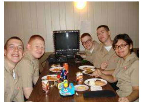
It is a truly heartwarming experience to see these young people who are so grateful and happy for a home cooked meal, and supported by Villa Park volunteers.